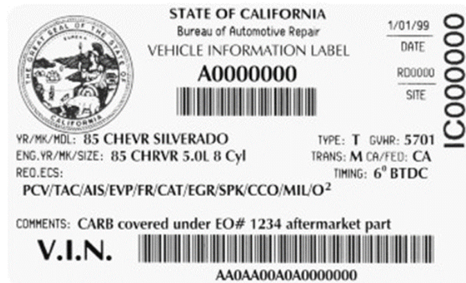
Figure 2: Example of Acceptable BAR Referee Label (all labels must include a serial number)

The BAR Referee Label serves as the emissions control “under-hood” label, providing emission control information for SPCNS, grey market vehicles, vehicles with engine changes, alternative fueled vehicles, and, as needed, other vehicles with unusual configurations. The Referee Label is typically, but not always, affixed to the left front door post. In some cases, the label may be located under the hood.